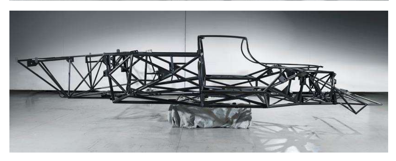
Body Shell Manufacture & Provisional Assembly to chassis.